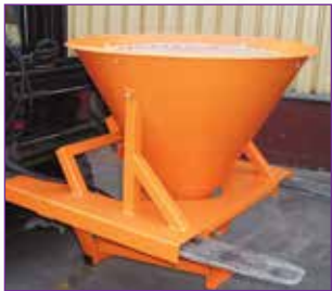
Hydraulic spreader REF 116TA6155