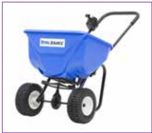
Manual spreader REF 138TA8173