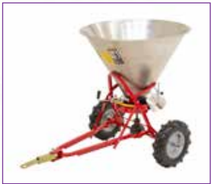
Stainless-steel spreader REF 135TA5672