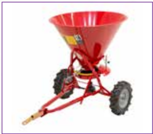
Painted-steel spreader REF 135TA5670

The range features different types of salt spreaders or gritters in various materials and with different capacities.