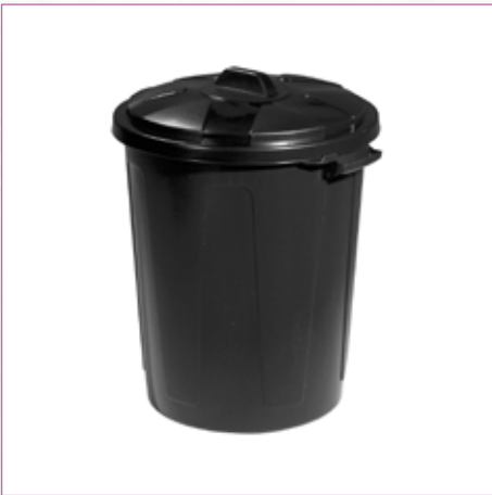
Dustbin magnum black