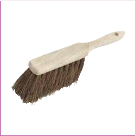
Small coco brush