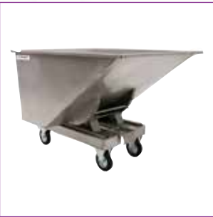
Stainless steel version