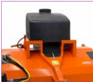
Water tank 200 l