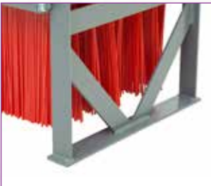
Support legs for M and L model