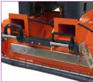
3-dimensional floating suspension