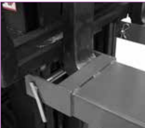
Fork lock pin for M and L model