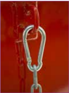
Safety chain (2)