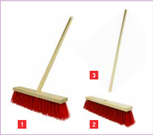
PVC brush with handle