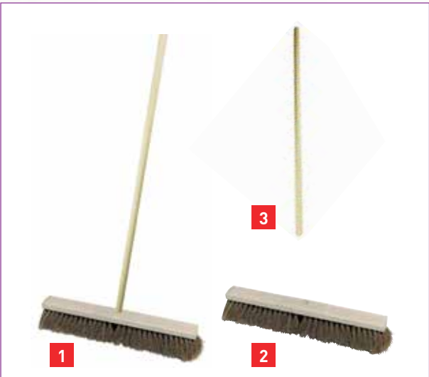
Coco brush with handle